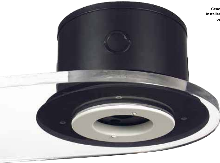
Genee Air installed in a ceiling