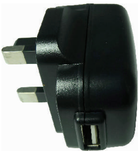
Optional USB adapter