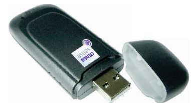
Optional Genee Sense Dongle

It's time to turn any ordinary whiteboard or flat surface into the state-of-the-art interactive workplace!